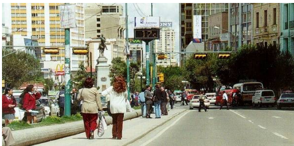
"El Prado" Avenue

La Paz is located at an elevation of 3,660 m.a.s.l, making it the world's highest "de facto" capital city, or administrative capital. La Paz was built in a canyon created by the Choqueyapu River (now mostly built over), which runs northwest to southeast. The city's main thoroughfare, which roughly follows the river, changes names over its length, but the central tree-lined section running through the downtown core is called the Prado . Owing to the altitude of the city, temperatures are consistently cool throughout the year, though the diurnal temperature variation is typically large. The city has a relatively dry climate, with rainfall occurring mainly in the slightly warmer months of November to March.