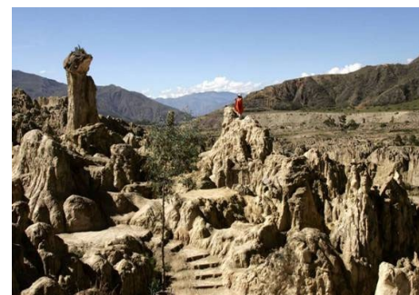
The Moon Valley

The Witches' Market ( Mercado de Hechiceria or Mercado de las Brujas ) is on Calle Linares between Sagarnaga and Santa Cruz. Vendors sell llama fetuses and dried frogs for Aymara rituals, as well as soapstone figurines and aphrodisiac formulas. This street is also the best place to pick up a charango or other Bolivian musical instrument.