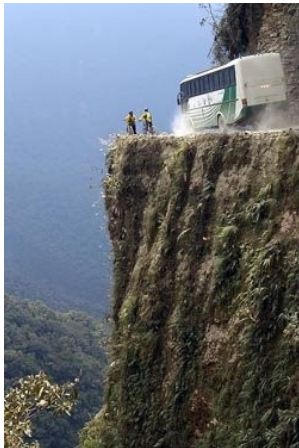
The Yungas "death" Road

Finally, Yungas , a tropical place under the Andes mountains, with another kind of landscape and culture, where you can have different adventure activities.