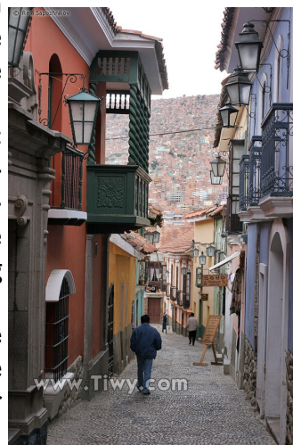
Jaen Rue, the museum's rue.

Rue Jaen: in this street you can find the most important museums of the city.